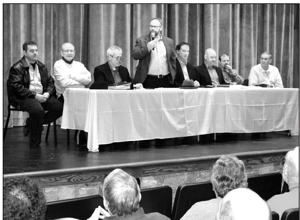
The BRMEMC Board of Directors speaks to members in the Jan. 26, 2016, town hall held at the Union County Schools Fine Arts Center.